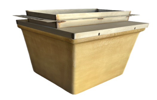
Retail Sump Base